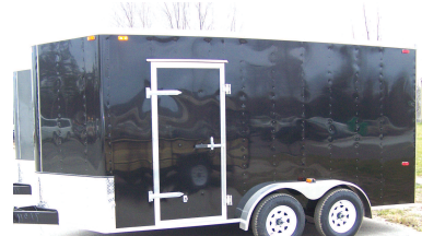
New Interstate 1 7x14 Enclosed Cargo Trailer Tandem axle, wedge nose, ramp door. $3,995