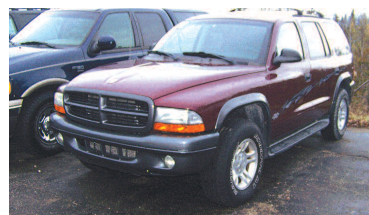
2002 DODGE DURANGO SXT 4x4, 8 cyl, air, cruise, power, tow pkg. AS LOW AS $199 A MONTH TO QUALIFIED BUYERS