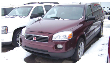
2007 SATURN RELAY VAN 4 captains chairs, OnStar, DVD. Fully loaded. AS LOW AS $199 A MONTH TO QUALIFIED BUYERS