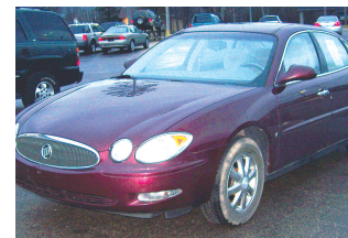
2007 Buick LaCrosse. As low as $249 a month