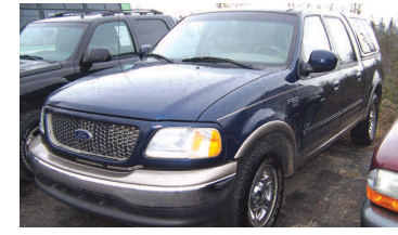
2003 FORD F-150 LARIAT 4 door, crew cab, fiberglass topper, tow pkg. AS LOW AS $199 A MONTH TO QUALIFIED BUYERS