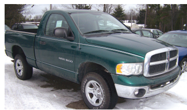
2003 DODGE RAM 1500 4WD Auto, tow pkg, bedliner. Only 97K. AS LOW AS $249 A MONTH TO QUALIFIED BUYERS