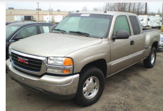
2003 GMC Sierra 1500 Z-71 4x4, Supercab, Flare side, 4 door, tow pkg. As low as $249 month