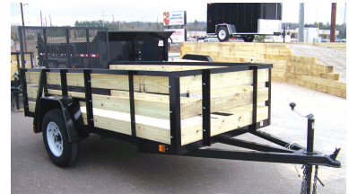
New US Cargo 5x8 Utility Trailer 5x8, 3,500 lb. axle $1,395