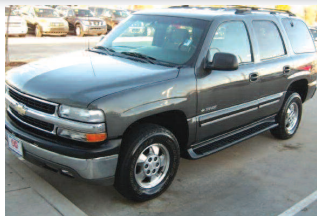
2001 Chevy Tahoe 4x4, Air, cruise, tow pkg. Only $5,995