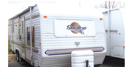
Used 2004 Sunline Solaris 25' Travel Trailer Awning, nice Sale priced at $6,495