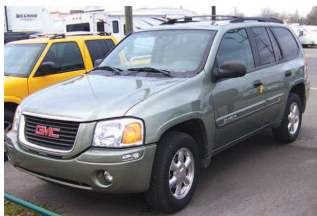
2004 GMC Envoy Power, air, cruise. Great for winter driving. As low as $249 month