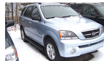
2005 KIA SORENTO LX 4X4 6 cyl, loaded. Good MPG in a 4 wheel drive. AS LOW AS $199 A MONTH TO QUALIFIED BUYERS