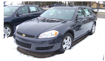
2008 CHEVY IMPALA LS Air, cruise, power, OnStar. 29 MPG. AS LOW AS $199 A MONTH TO QUALIFIED BUYERS