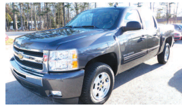
2011 CHEVY SILVERADO 1500 LT Only 23,145 miles. 8 cyl, OnStar, power everything. Bedliner, tonneau cover AS LOW AS $269 A MONTH TO QUALIFIED BUYERS