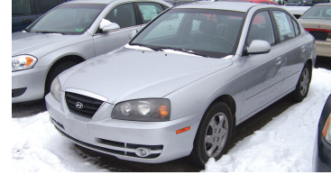
2004 HYUNDAI ELANTRA 4 cyl, 29 mpg, air, cruise, power. AS LOW AS $169 A MONTH TO QUALIFIED BUYERS