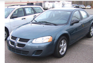
2005 Dodge Stratus SXT Gas saver. As low as $199 month