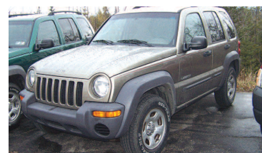
2004 JEEP LIBERTY 4x4, air, cruise. AS LOW AS $225 A MONTH TO QUALIFIED BUYERS