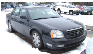
2003 CADILLAC DEVILLE DTS Heated seats, leather, power sunroof and everything you expect from a Cadillac. AS LOW AT $199 A MONTH TO QUALIFIED BUYERS