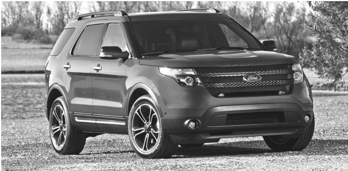
2013 Ford Explorer Sport: The first-ever high-performance Explorer model features a 350-horsepower 3.5-liter EcoBoost V6, structural chassis enhancements for improved dynamics, and sporty design cues.