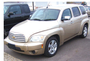
2006 Chevy HHR LT Power, air, cruise. Very nice. As low as $249 month