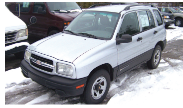
2000 CHEVY TRACKER 4X4 Only 103K, air, cruise, auto, tow pkg. AS LOW AS $149 A MONTH TO QUALIFIED BUYERS