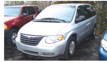
2007 CHRYSLER TOWN & COUNTRY LX Stow-n-Go seating, seats 7, remote keyless entry, air. AS LOW AS $199 A MONTH TO QUALIFIED BUYERS