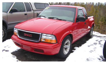
2002 GMC SONOMA Ext. cab, 6 cyl, sportside, bedliner. AS LOW AS $199 A MONTH TO QUALIFIED BUYERS