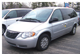
2007 Town & Country Slow & Go seating. Power, air, cruise. As low as $199 month.