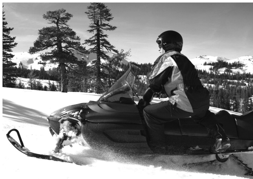
Snowmobilers will see trail signage changes on state trails starting this winter.