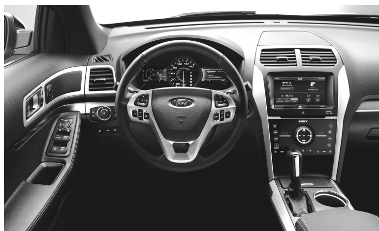
2013 Ford Explorer Sport: The new Explorer Sport features unique interior design cues and leather faced seats with contrast stitching, inspired by fashion accessories such as Prada handbags.

Ford engineers also added chassis tunnel reinforcements and a solid-mounted electric power-assisted steering (EPAS) rack with improved pedal feel and response for drivers, both on-road and off. This model comes standard with larger brakes for improved pedal feel, stronger resistance to fade and better performance while