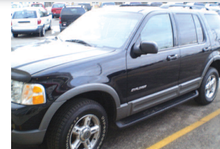
2002 Ford Explorer 4x4, Leather, 3rd row seat, tow pkg. As low as $249 a month