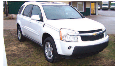
2006 CHEVY EQUINOX AWD, power sunroof, power everything. AS LOW AS $224 A MONTH TO QUALIFIED BUYERS