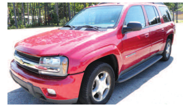
2004 CHEVY TRAILBLAZER EXT LT 4 Dr. 6 cyl, power everything, 7 passenger, leather, tow pkg. AS LOW AS $199 A MONTH TO QUALIFIED BUYERS