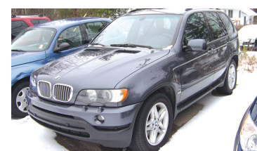
2003 BMW X5 4.4i AWD GPS, leather, loaded. AS LOW AS $269 A MONTH TO QUALIFIED BUYERS