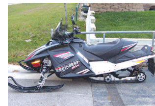
2006 Ski-Doo GSX 380 Only $2,995