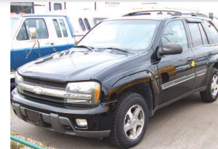
2002 Chevy Trailblazer 4 door. Just $4,995