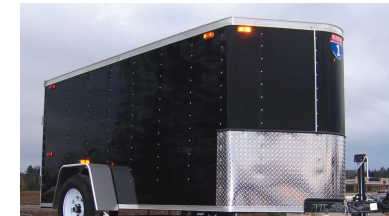
New Interstate 1 5x10 Enclosed cargo Trailer. Wedge nose, 3,500 lb. axle $2,195