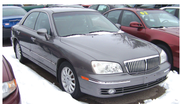
2004 HYUNDAI XG 350 L Sunroof, leather, loaded. AS LOW AS $229 A MONTH TO QUALIFIED BUYERS