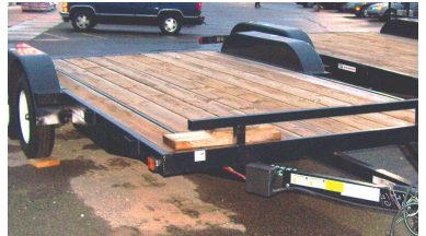
New Flatbed Car Hauler. 8 1/2 foot x 16 foot. 2 to choose from. Sale Priced at $2,295.