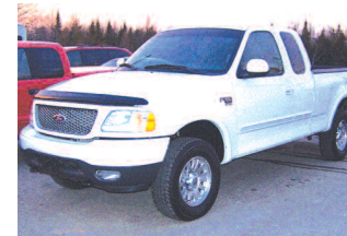
2003 Ford F-150 Sport 4x4, Supercab. As low as $249 month