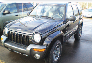
2002 Jeep Liberty 4x4, Cruise, air, sunroof. As low as $249 a month